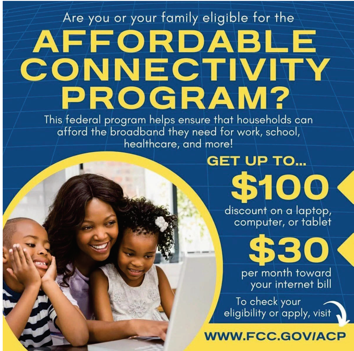
EXHIBIT 4: SAMPLE ADVERTISEMENT